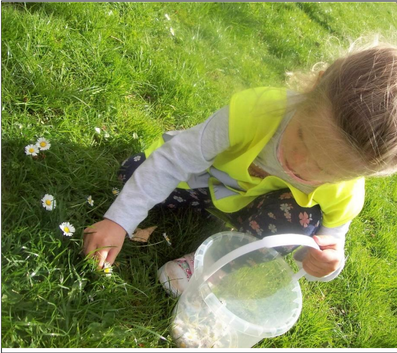
SPRING IS HERE!